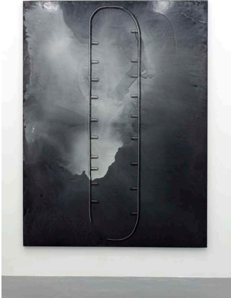
And Light the Day , 2015, 244cm x 184cm, acrylic on canvas